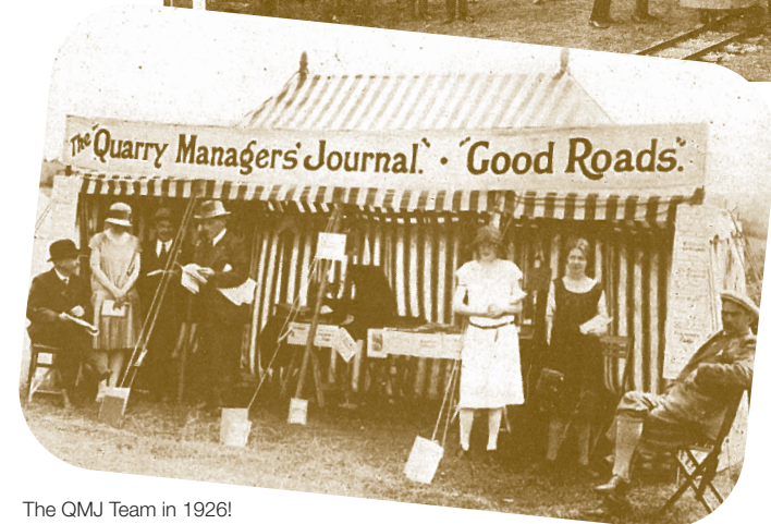
The QMJ Team in 1926!